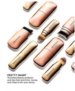
PRETTY SMART The latest beauty products and tips that save time, money, and—best of all—your sanity.